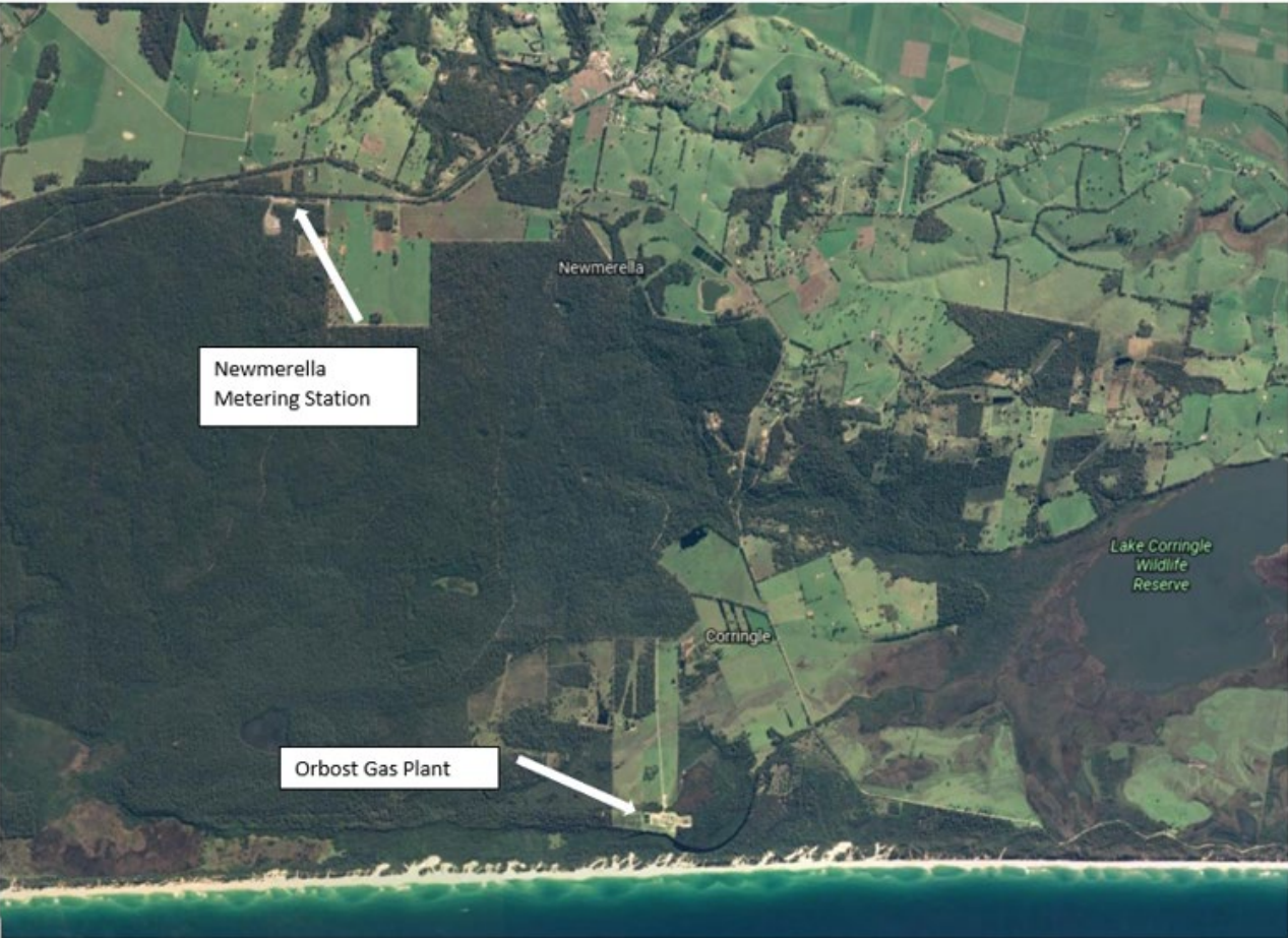
Figure 2: Orbest Gas Plant and Newmerella Metering Station locations